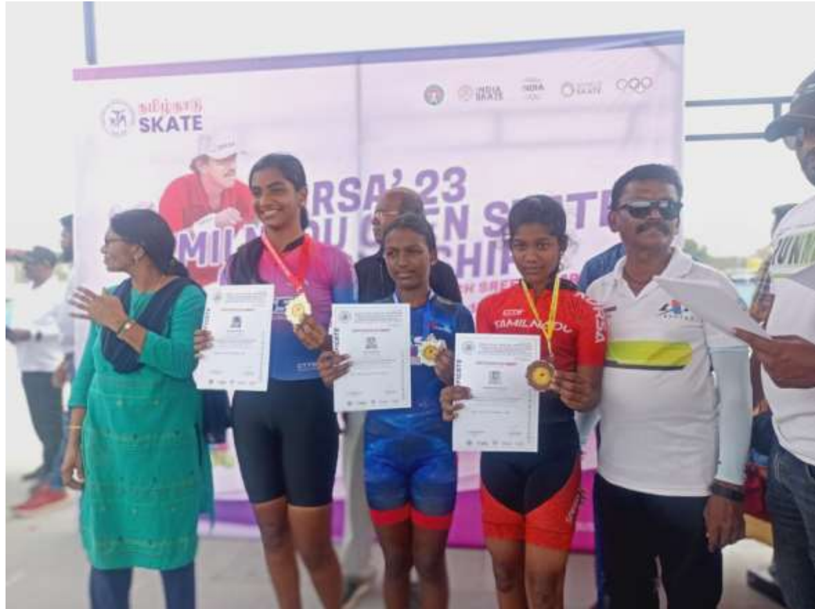
TNRSA STATE LEVEL CHAMPIONSHIP