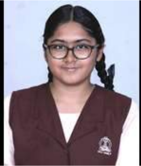
KAVINAYA XI C