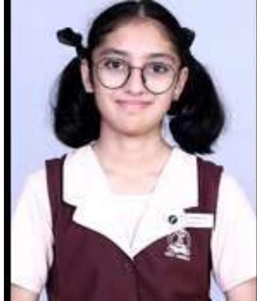
EVENITHA X A