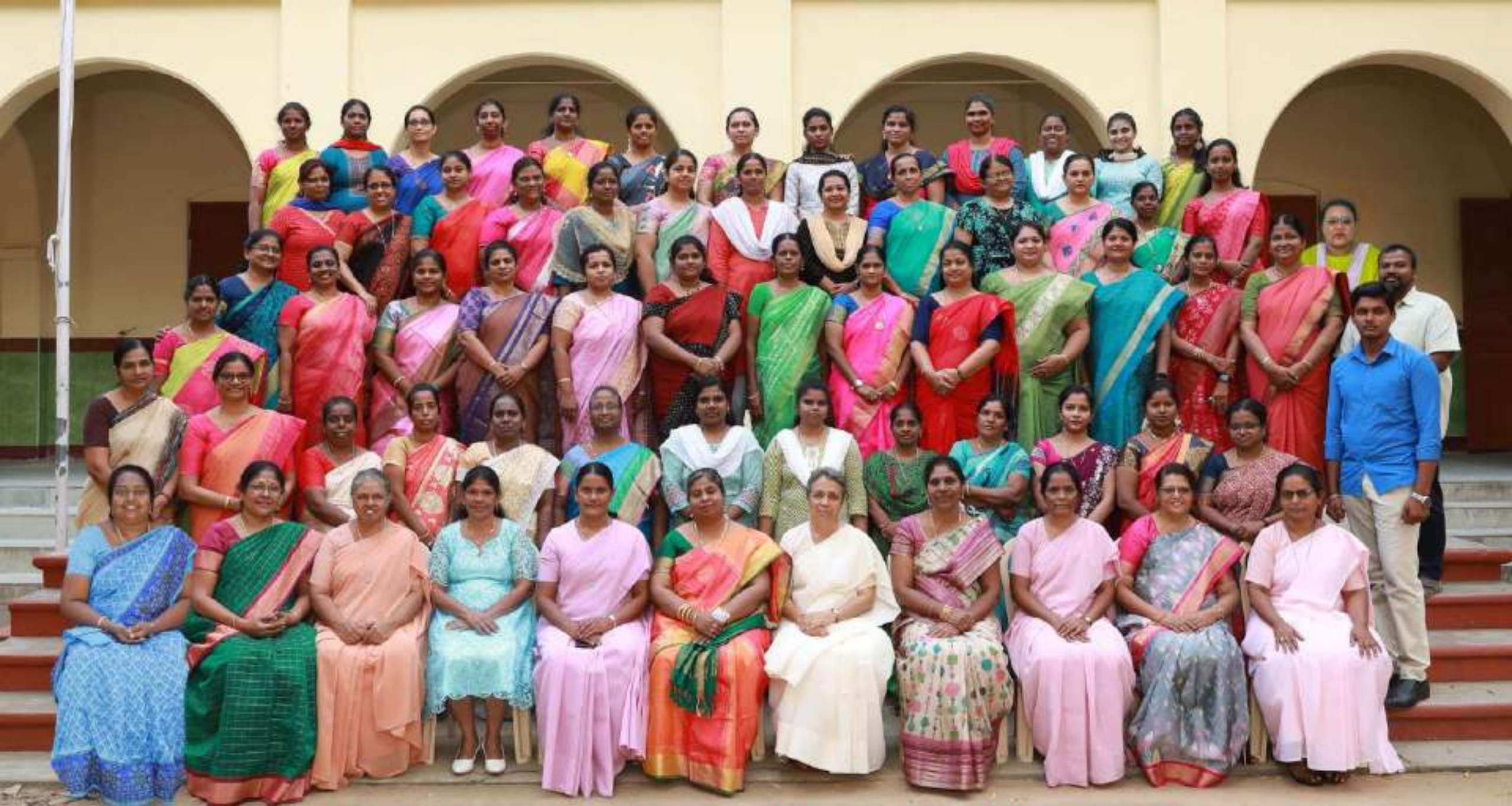
HOLY ANGELS' ANGLO - INDIAN HR.SEC.SCHOOL