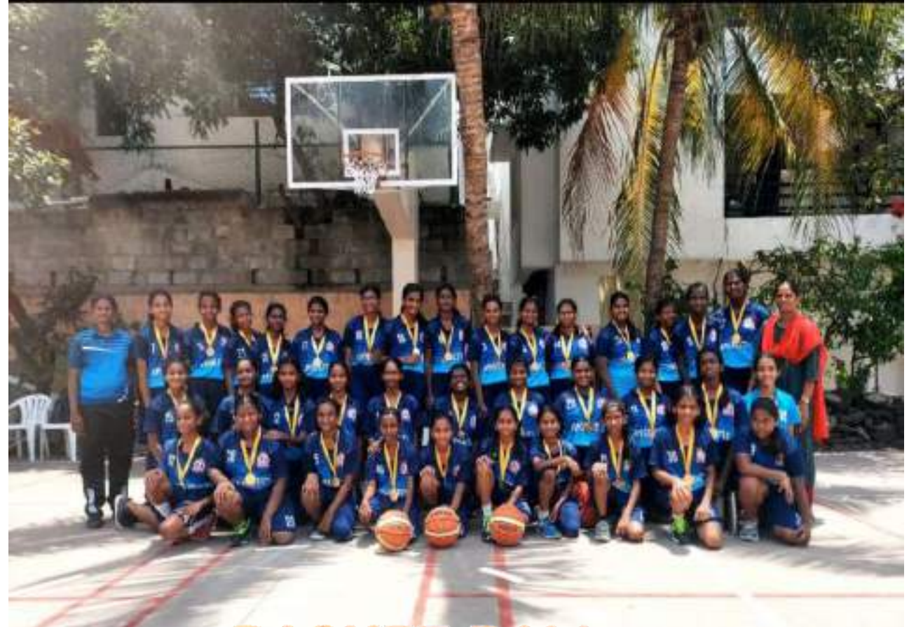
BASKET BALL ZONAL LEVEL WINNERS